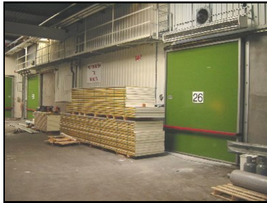
Part of the existing storage area - before floor surface upgrade.

The material had to be capable of flexibility as well as have HARD WEARING properties.